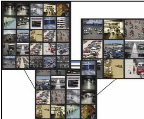
videoNext's v-MX solution

videoNEXT has introduced its v-MX video wall solution, the v-IQ and its v-AC. All three units are designed to help professionals manage their security solutions. The v-MX is a new virtual-multiplexing display system that enables videoNEXT's Security Knowledge Manager (SKM) users to display live and archived video and command and control data to an infinite number of displays in their command center.